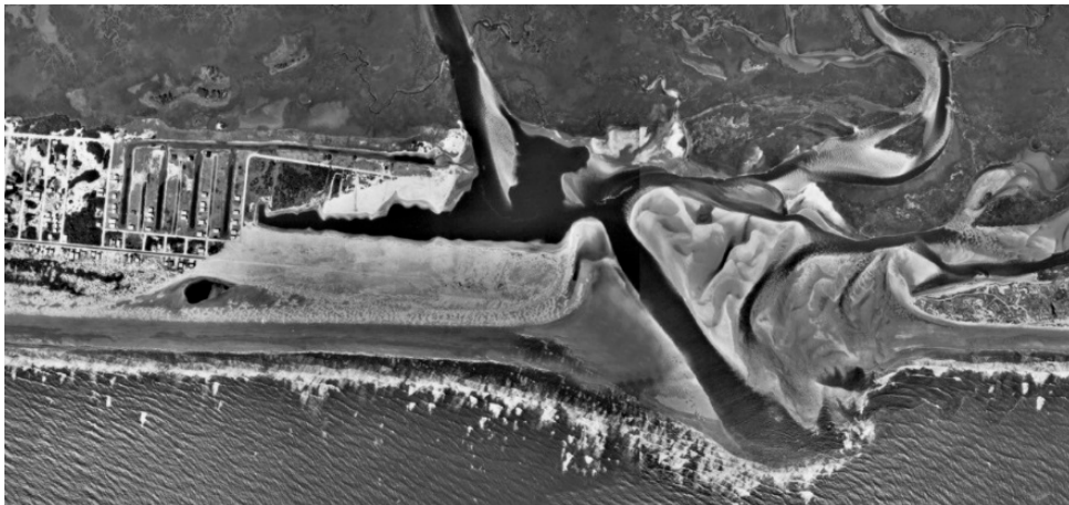
Figure 3. Tubbs Inlet 1974 (Originally printed in Cleary & Marden, 1999)

Figure 4 provides a plan view of the proposed maintenance dredging project as described above. The design template for the Feeder Channel follows the same alignment as proposed under permit 45-02 with small adjustments to avoid the existing marsh grass. In addition, the design depth for the proposed action has been raised from -5.27 MLW to -5 MLW. Raising of the design depth should help to simplify the construction process and reduce the potential for adverse impacts. The dredging proposal includes a 1-ft allowable overdredge template to provide a buffer for maneuvering the construction equipment within the work area. Therefore, the maximum dredge depth in the Feeder Channel extends to -6-ft MLW, inclusive of the proposed 1-ft allowable