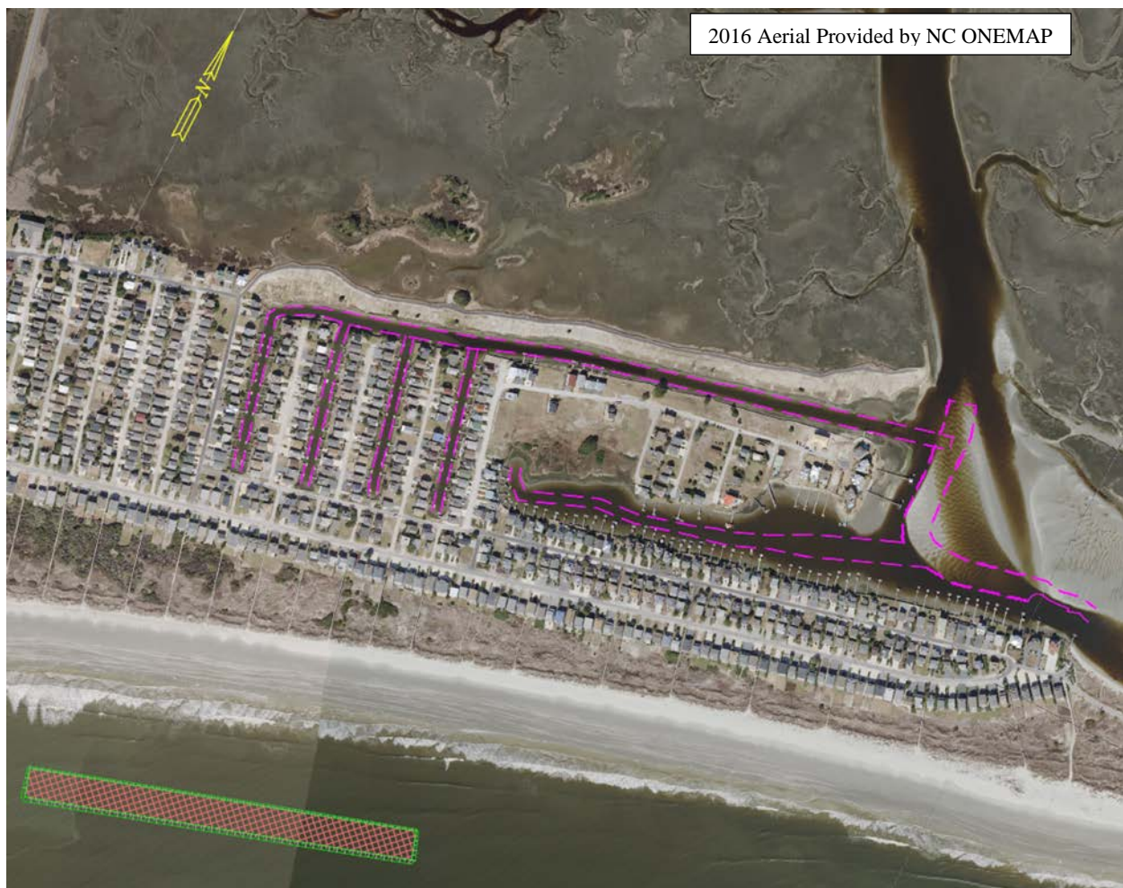
Figure 4. South Jinks Creek, the Bay Area, and Feeder Channel Work Areas

The proposed template for the finger canals maintains a constant 20-ft width. This represents a reduction from the 2002 permitted template, which provided a varying width between 20-ft & 30-ft. The reduction in width helps provide adequate clearance between the proposed channel and the existing residential docks. In many instances, the navigable waterway through finger canals A-D remains even less than 20-ft wide. Therefore, the dredge equipment most likely will not be able to access the full channel even with the reduced 20-foot width. Although the docks may be moved by the private homeowners to help facilitate construction, expectations suggest the docks would be returned to their original position after the maintenance event. Therefore, there would be little public benefit in providing more than a 20-foot channel through the residential waterway.