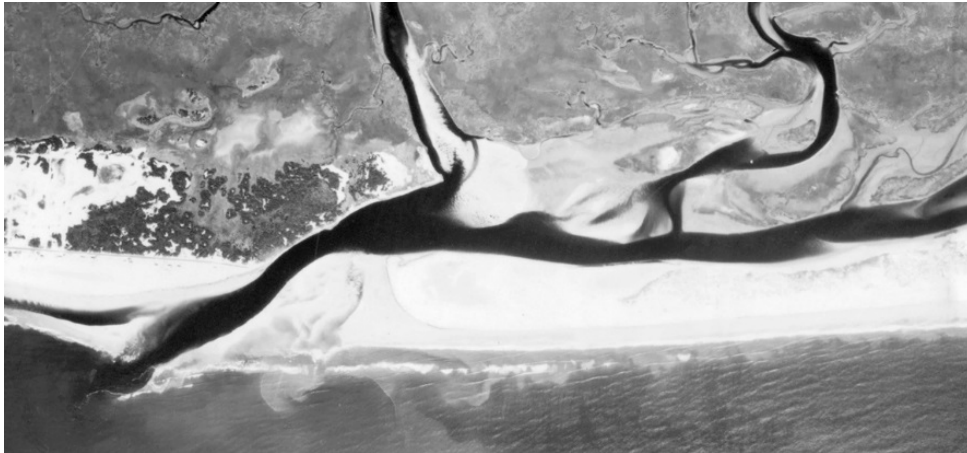
Figure 2. Tubbs Inlet 1966 (Originally printed in Cleary & Marden, 1999)

The proposed maintenance dredging will help establish and maintain a navigational channel for access to the residential docks along the east end of Sunset Beach. Sediment runoff from storm events has most likely impaired access through the Bay Area and Feeder Channel while shoaling from sediment transport has impaired navigation in south Jinks Creek. As a result, the Town of Sunset Beach has proposed the maintenance operations as part of a long-term management strategy to maintain navigation access for small recreational vessels through the waterbodies. However, future maintenance operations will be requested through separate permit applications.